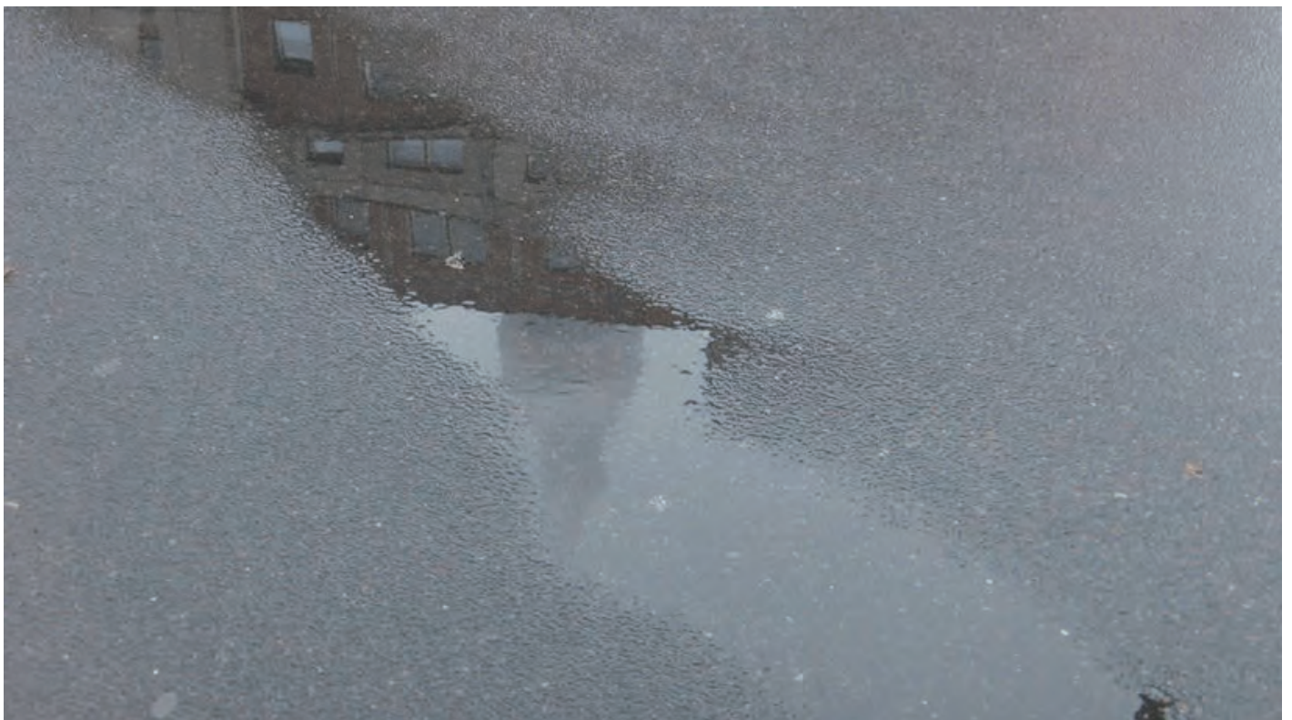
Mordor's Eye / Crack / , 2009 _ 48 x 27 cm _ C-Print _ Ed. 5 + 2.A.P.