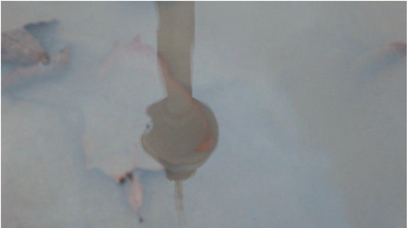
Mordor's Eye / Liebe / , 2011 _ 48 x 27 cm _ C-Print _ Ed. 5 + 2.A.P.