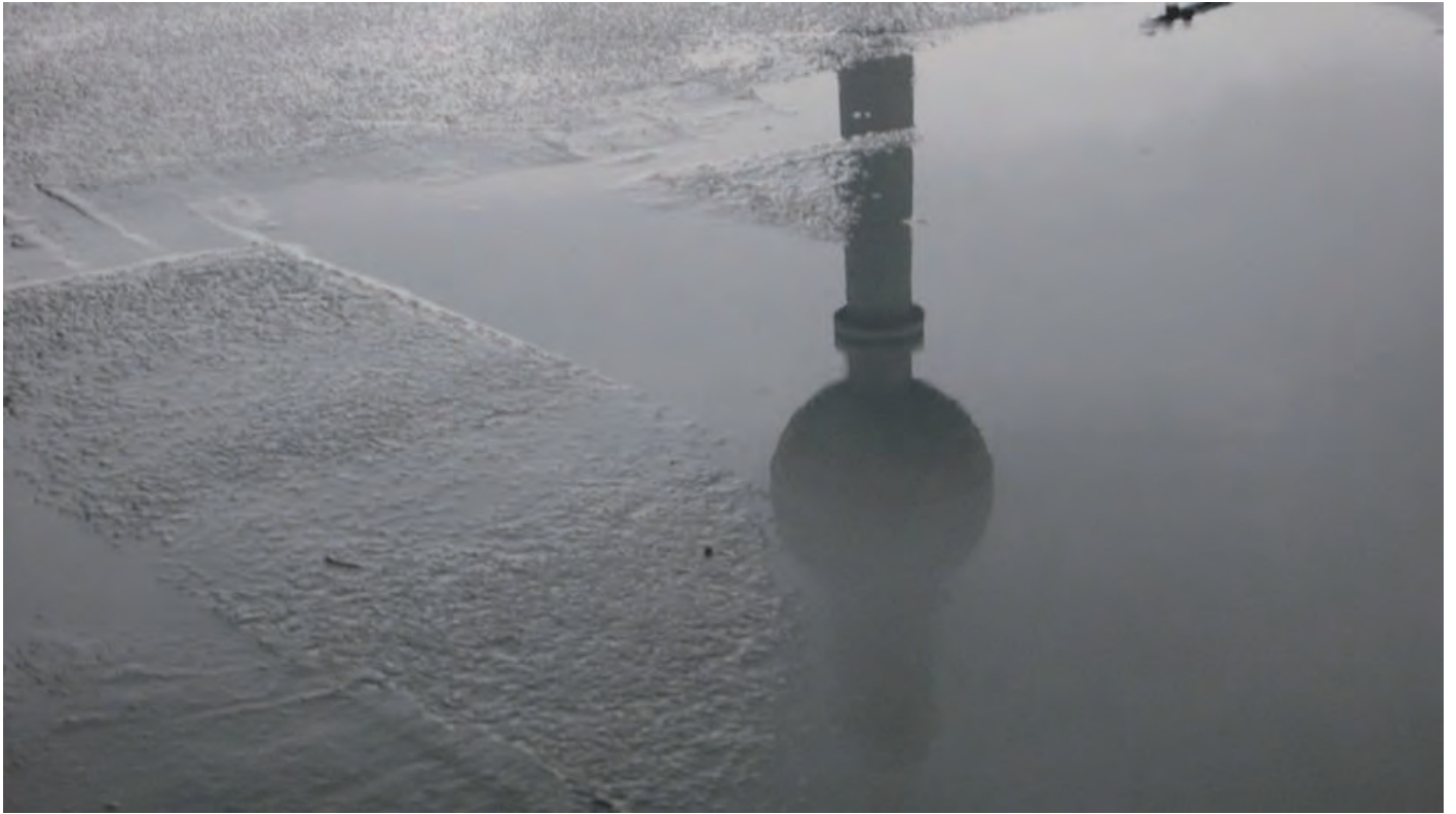
Mordor's Eye / Nebel /, 2010 _ 48 x 27 cm _ C-Print _ Ed. 5 + 2.A.P.