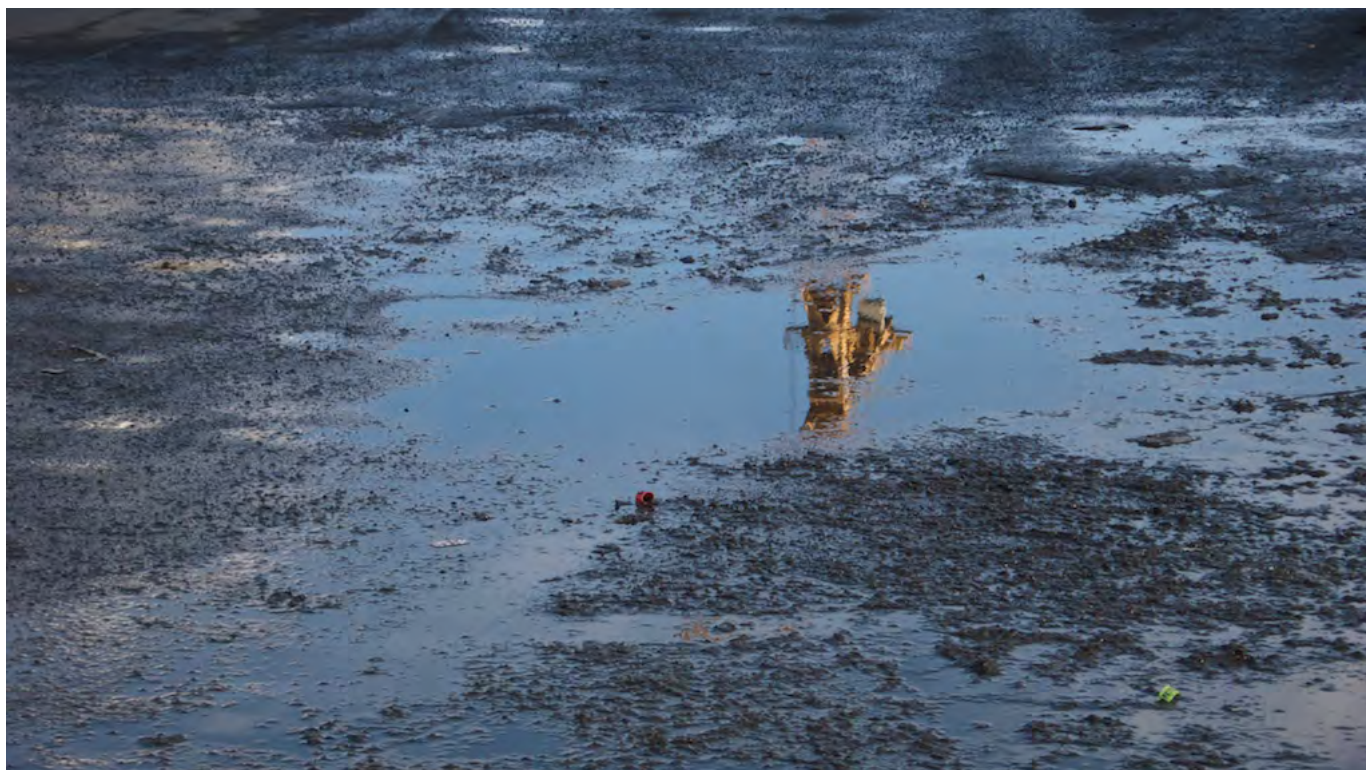
Grúa / Serie Reflejos , 2011 _ 48 x 27 cm _ C-Print _ Ed. 5 + 2.A.P.

What do you see at the edge of your footsteps? Quite sure that your eyes advance exactly like you do: moving ahead, not for any other reason that you are a biped without feathers. They look for other human beings who walk, who ride their bikes or glide along the streets wrapped in plastic and steel shells so called cars. Yes, pretty sure that you stopped looking at the ground long time ago, just knowing you are a technological advanced hominid in a world where the marks have become worthless. Footprints and traces populated the Earth when your ancestors were hunters and recollectors, but your neolitical contemporaries don't need them anymore. Maybe symbols, directions, traffic signals, indications for being a proper pedestrian are good enough for you because, quite probably, you are a kind person who understands that it is convenient to pay attention at the guidelines. Perhaps it also happens that there are people like me. I look at the ground, you know? I seek traces, I search, I search, I collect them, gazing at what it is not important, the tiny things, marks, signals, wiped off trails, fleeing images that remain only some hours in the puddles you walk on without seeing them, without looking at them, without remembering them because you never paid attention. I offer you - unavoidable part of this comfortable Cain's invention named city- their-your contingency.