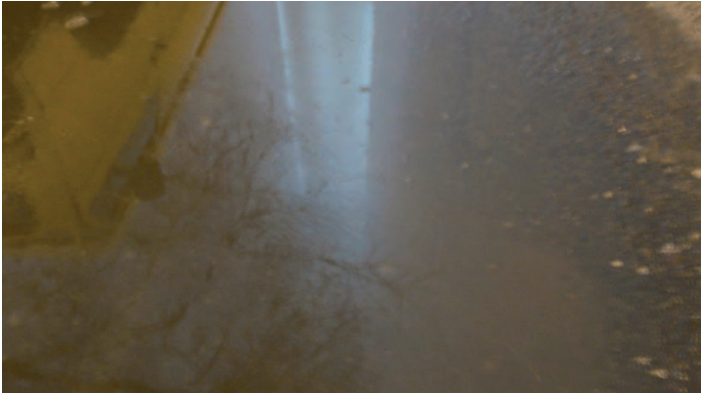
Mordor's Eye / Biberkopfs Verlassens seiner Spelunken / 2011 _ 48 x 27 cm_C-Print_Ed. 5 + 2.A.P