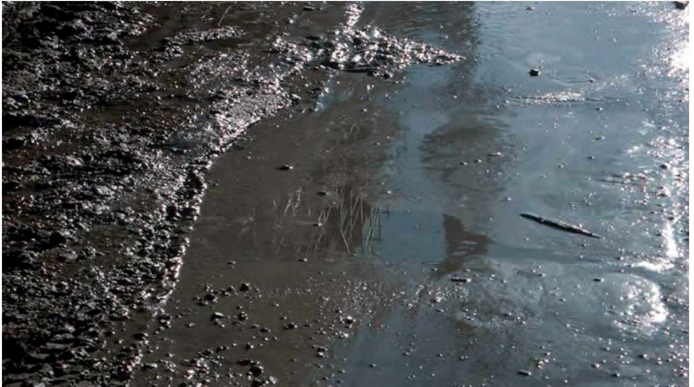
Mordor's Eye / Untitled /, 2009 _ 48 x 27 cm _ C-Print _ Ed. 5 + 2.A.P