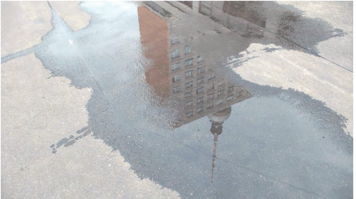
Mordor's Eye / Liebe / , 2011 _ 48 x 27 cm _ C-Print _ Ed. 5 + 2.A.P.