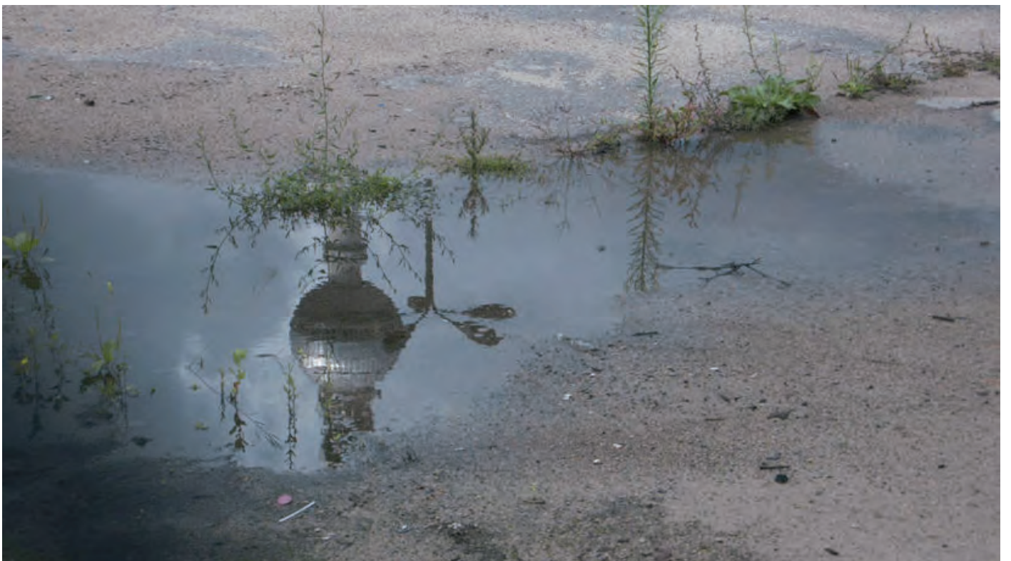
Mordor's Eye / Among flowers /, 2010 _ 48 x 27 cm _ C-Print _ Ed. 5 + 2.A.P.