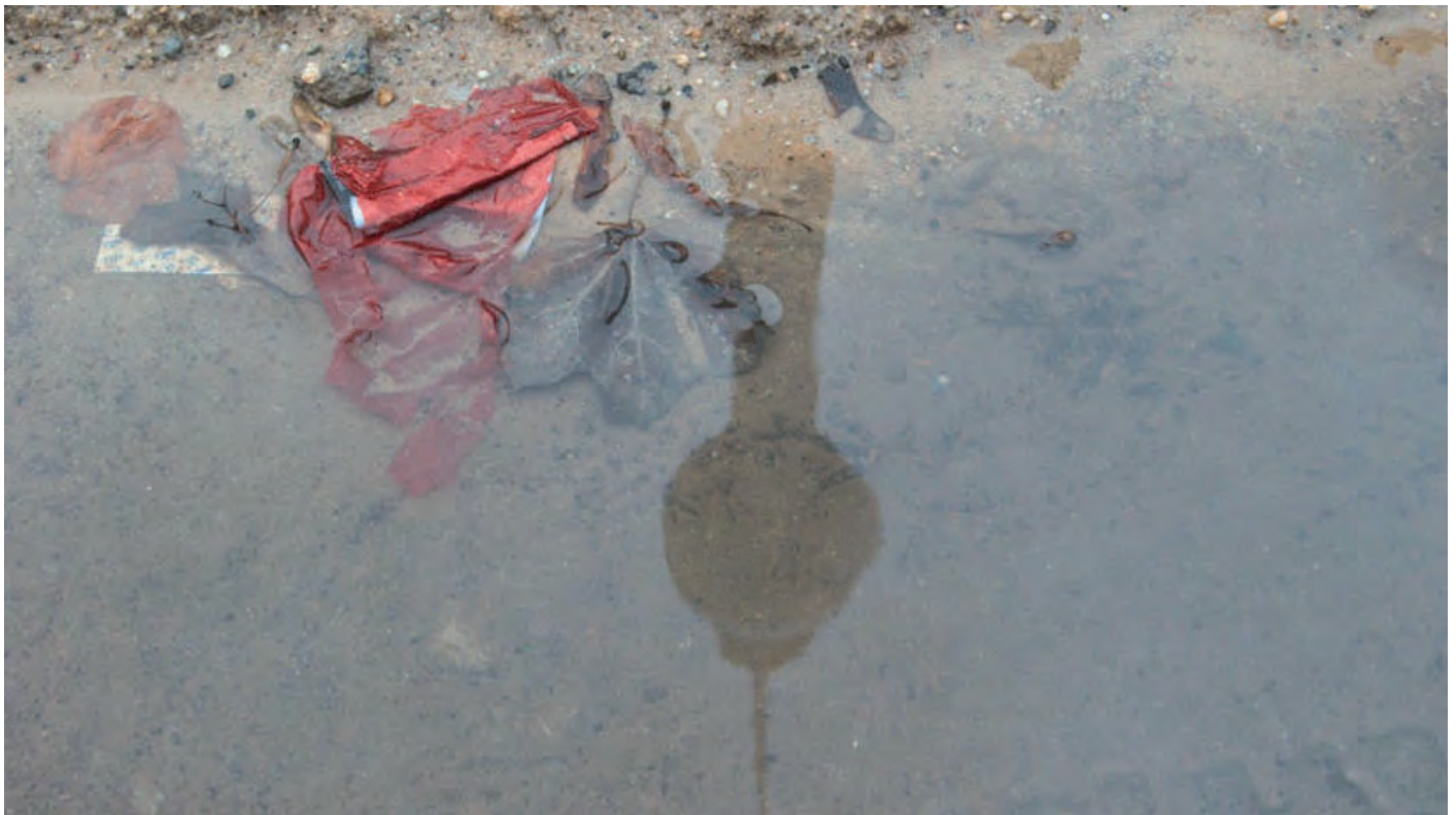
Mordor's Eye / Crack / , 2009 _ 48 x 27 cm _ C-Print _ Ed.5 + 2.A.P.