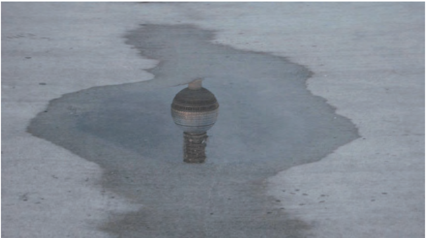
Mordor's Eye / Crack / , 2009 _ 48 x 27 cm _ C-Print _ Ed. 5 + 2.A.P.