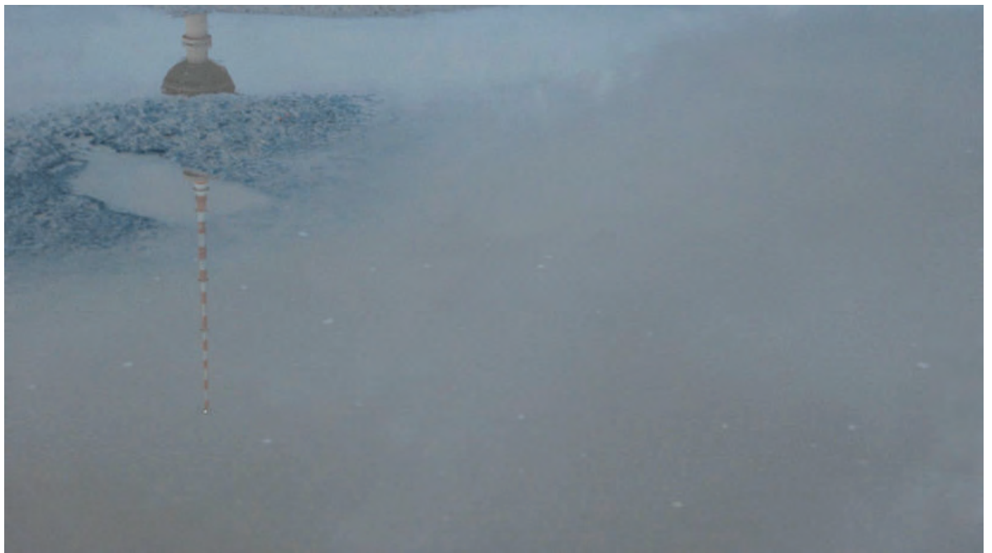
Mordor's Eye / High tide /, 2011 _ 48 x 27 cm _ C-Print _ Ed. 5 + 2.A.P